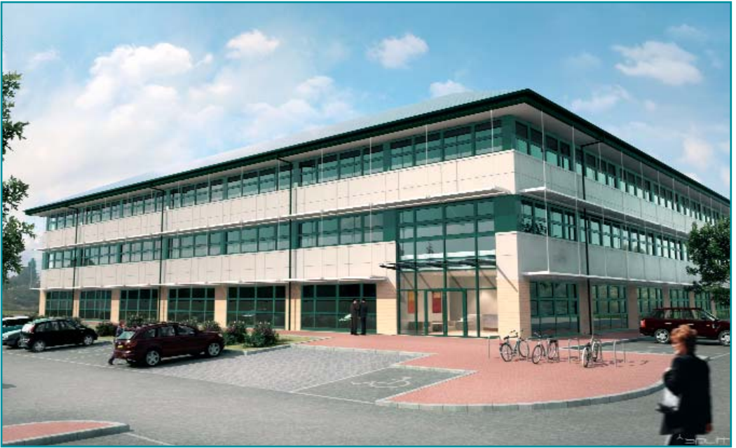
Houghton Place | Building One - 52,439 sq ft arranged over three floors