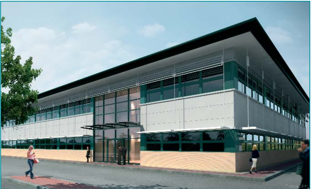
Houghton Place | Building Two - 50,000 sq ft arranged over two floors