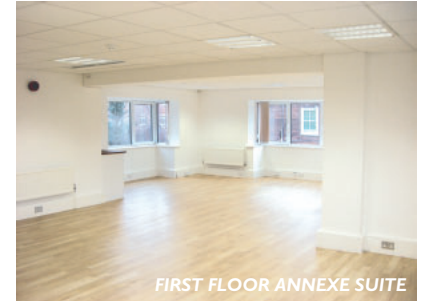
FIRST FLOOR ANNEXE SUITE

Nic Pocknall nic@hurstwarne.co.uk 01372 360190 07770 416219